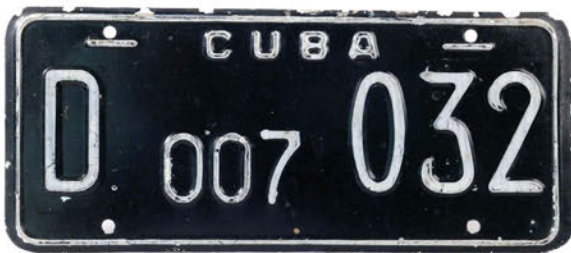
Cuba license plate: Acquired in 2011 on a medical mission to Cuba, organized by Edward's Young Presidents' Organization chapter. "Cuba is famous for its old cars. I kind of think about where that plate was, and it's a diplomat's plate. Somebody cool was driving around in that car."