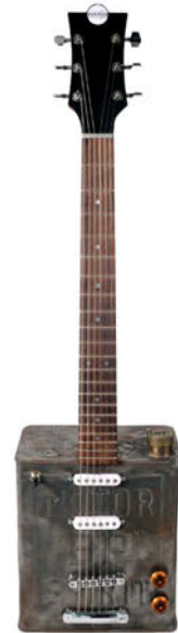
Bohemian oil can guitar: "I think it's really cool that they can take an old oil can and repurpose it into a guitar that looks like a piece of art."